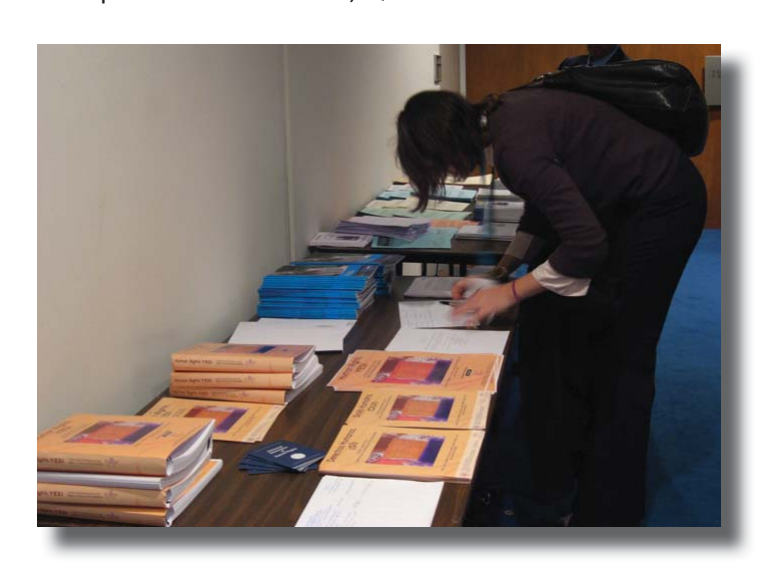
Human Rights. YES! was launched at the United Nations (New York) on December 3rd, the UN International Day of Disabled Persons.

due to their minority status. Human Rights. YES! was written by experts in the fields of disability rights, international human rights law, human rights education, and grassroots advocacy. It was developed by BlueLaw, LLP, Advocating Change Together, Disabled Peoples' International, and the Harvard Law School Project on Disability. The project was generously funded by the Shafallah Center for Children with Special Needs in Doha, Qatar.